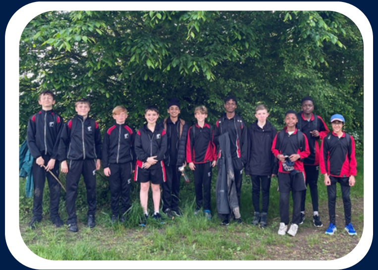
The Holcombe Grammar teams from Year 7, 8 & 9 who represented the school with distinction.